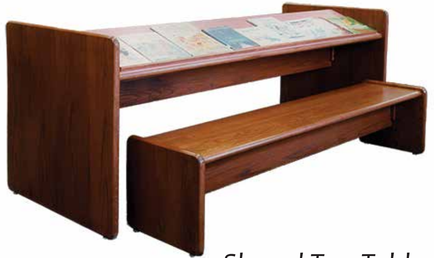
Sloped Top Table